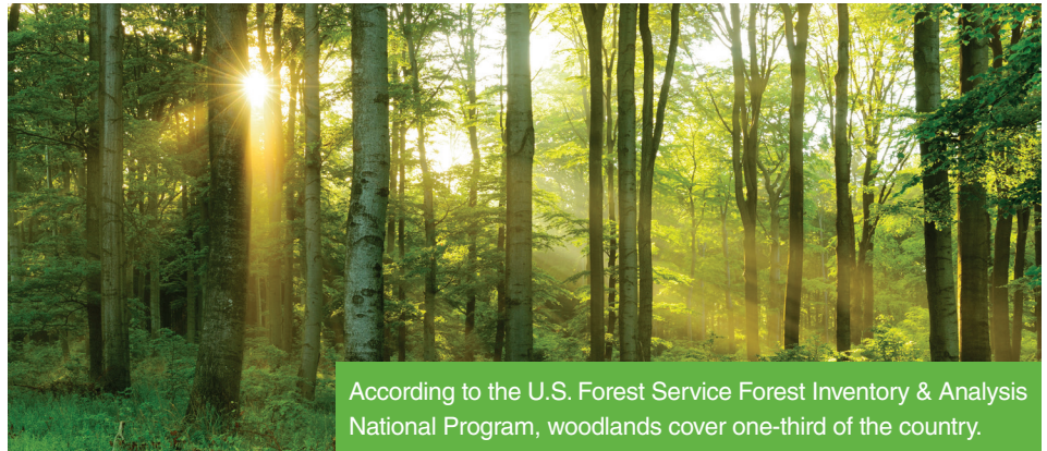
According to the U.S. Forest Service Forest Inventory & Analysis National Program, woodlands cover one-third of the country.

An acre with at least 10 percent tree canopy qualifies as a forest for purposes